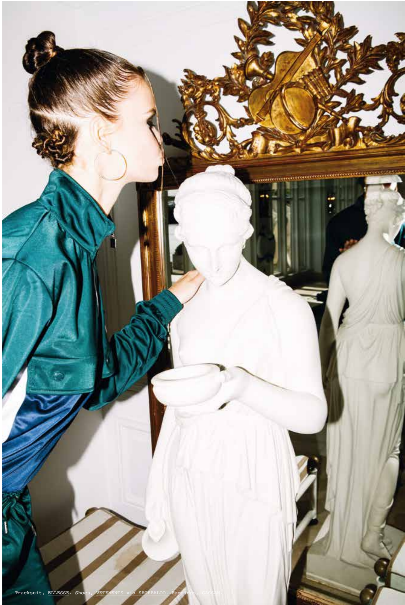
Tracksuit, ELLESSE. Shoes, VETEMENTS via SHOEBALOO. Earrings, GASSAN.